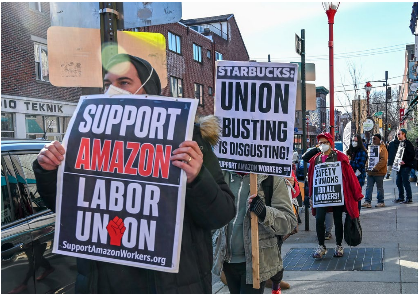
Workers campaigning for unionization in Philadelphia, USA.